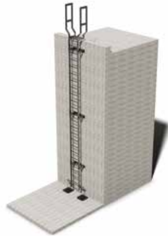
Ladder with step through - no hoops

Please see data sheet overleaf for the many options available.