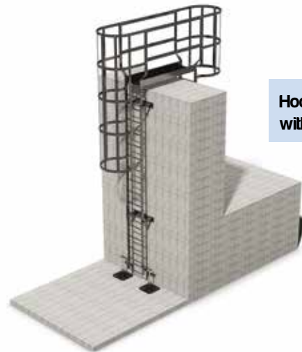
Hooped Ladder with platform