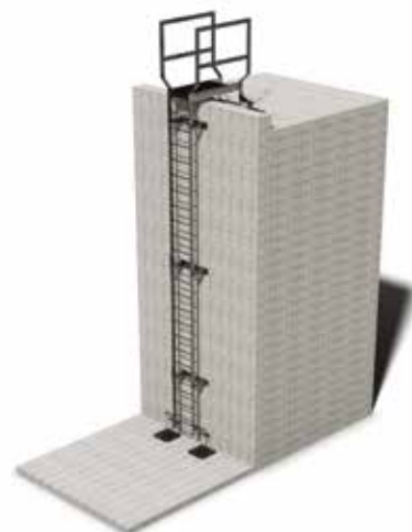
Ladder with step through & step down - no hoops